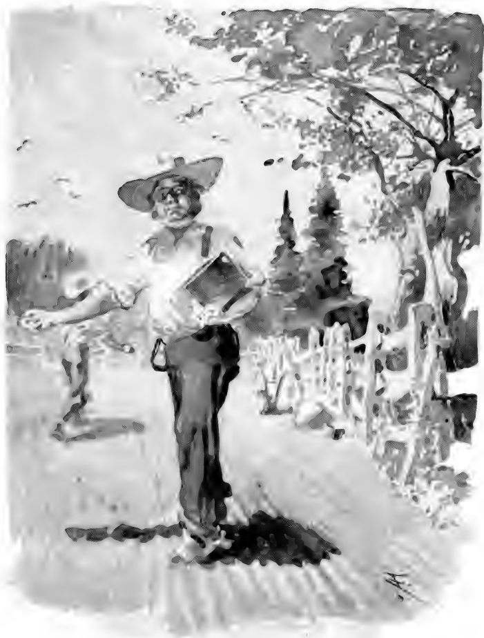
"FLING WIDE THE GENEROUS GRAIN."—Page 24.